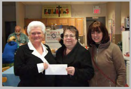
Thanks to YOUR generosity!

Hot Lunches! Pure Music! Smiles! Laughter & Love